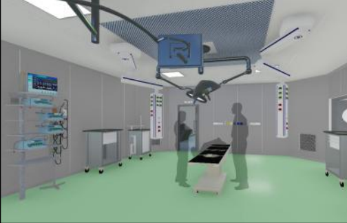
Left: architect's impression of an operating theatre in the new Trauma centre

We are creating a state of the art Trauma Centre . Ideally placed, on the Bangalore-Chennai highway, this is a much needed response to the plight of accident victims within a 50km radius. If you can contribute to the cost of equipping the trauma centre, or can help us meet the treatment costs of disadvantaged accident victims, please contact the Development Office.