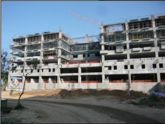
Above: Construction underway