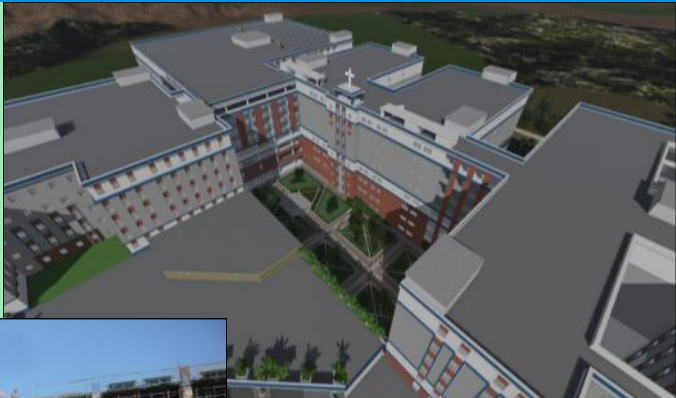
Above: Architects impression of hospital

Phase 1 focuses on non-infectious diseases such as cancer and heart problems. But eventually all specialities will be made available there.