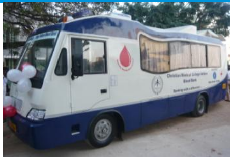
Give blood ... give life

We always need blood to save precious lives. Staff, volunteers and patient relatives contribute. State Bank of India joined CMC in " Banking with a difference " by gifting this smart Blood Donor Van to collect blood donations from the public around Vellore. Three people at a time can donate in comfortable AC conditions.