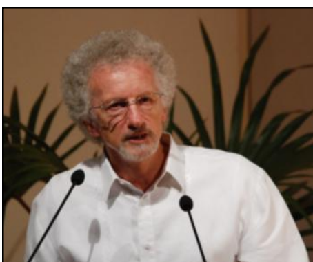
Philip Yancey speaking

The Dr. Ida .S. Scudder Humanitarian Oration 2014 was awarded posthumously to Dr. Paul Brand, and the oration was delivered in his honour by the internationally acclaimed author and communicator Philip Yancey – his close friend and collaborator. Together they wrote several books including Fearfully and Wonderfully Made and The Gift of Pain .