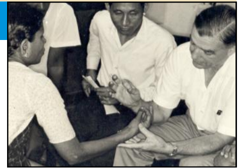
Dr. Paul Brand at work