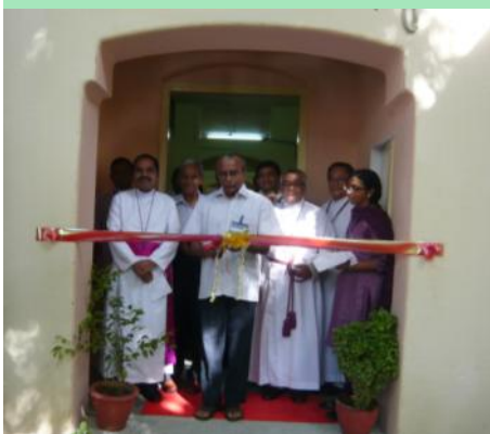
Dedication of Shalom Centre

In June we opened the Shalom Family Health Centre for Vellore residents.