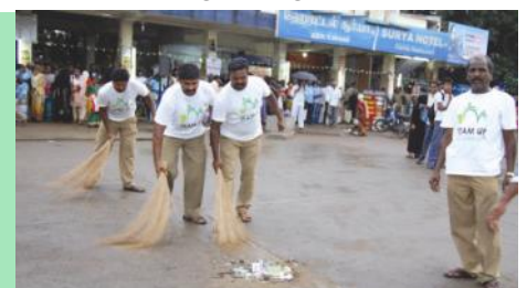
CMC Clean Team in action

In keeping with the Prime Minister’s Swachh Bharat Abhyan campaign, CMC celebrated September 25 - 30 as Cleanliness Week. Special efforts were made to clean the hospital premises, departments, offices, wards and other areas, besides extending action to the crowded roads adjoining the hospital. Staff and students enthusiastically joined in the sanitation drive through mass education, debates, poster and slogan competitions on the theme, Team Up to Clean Up . Prizes were awarded to the cleanest ward and outpatient clinic. If we all refrain from littering and spitting, together we can move towards a cleaner, more pleasant environment, which will also improve the nation’s health.