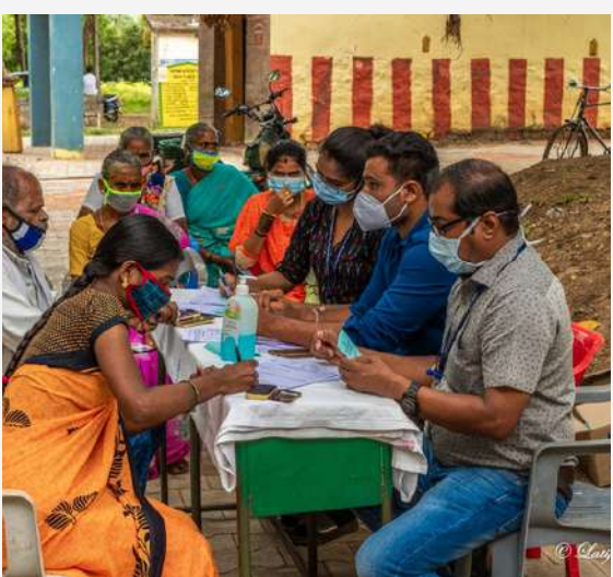
Vaccination Awareness & camps in rural Vellore