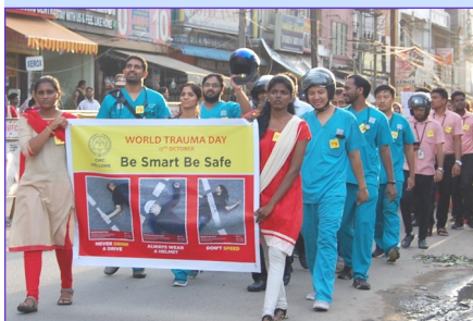
Helmet awareness walk

Ideally located on the busy NH 48 between Chennai and Bengaluru, the new trauma centre will have 140 beds (including High Dependency and ICU) 7 state-of-the-art operating theatres, and a dedicated CT Scanner, ultrasound and x-ray. The specialist doctors and support teams will give multi-disciplinary care under one roof. It will be a pioneering, Level 1, trauma centre.