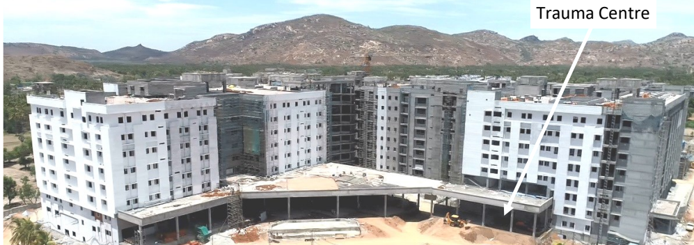
Kannigapuram hospital nearing completion

2020 marks 120 years since CMC's founder, Ida Scudder, started her work in Vellore. We still respond to urgent medical needs today. Our new Kannigapuram hospital, 10 km from CMC, opens mid-2020. It will address issues of the modern age—especially trauma. Road accidents are the leading cause of death for people aged 5-29 years. Around 1,50,000 people die on India's roads each year and three times as many suffer long-term disabilities. CMC's Trauma Care Centre will save victims' lives, reduce disabilities and rehabilitate survivors.