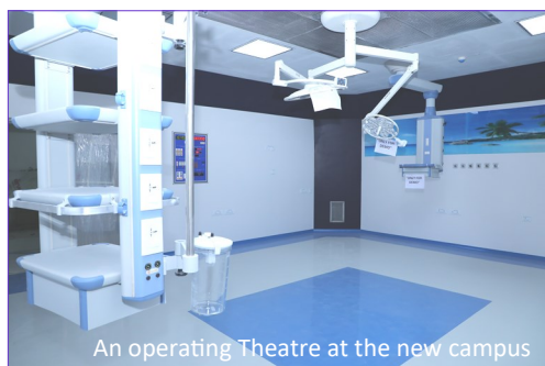
An operating Theatre at the new campus

On 17th October we marked World Trauma Day with an awareness march. Staff, doctors and students walked from the Vellore Fort to CMC hospital carrying banners and shouting slogans. Throughout the day there were stalls showing first aid techniques and safety tips. A motorbike simulator tested peoples' driving skills. The blood bank donor bus was parked there, allowing people to donate blood on the day.