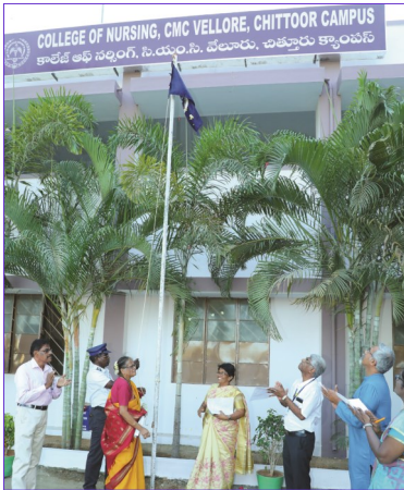
Dedication of Chittoor Nursing College

Breaking News: The College of Nursing, CMC Vellore Chittoor Campus, has just admitted its first batch of 50 students.