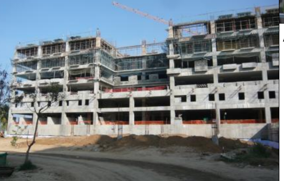
Above: Construction underway

Phase 1 focuses on non-infectious diseases such as cancer and heart problems. But eventually all specialities will be made available there.